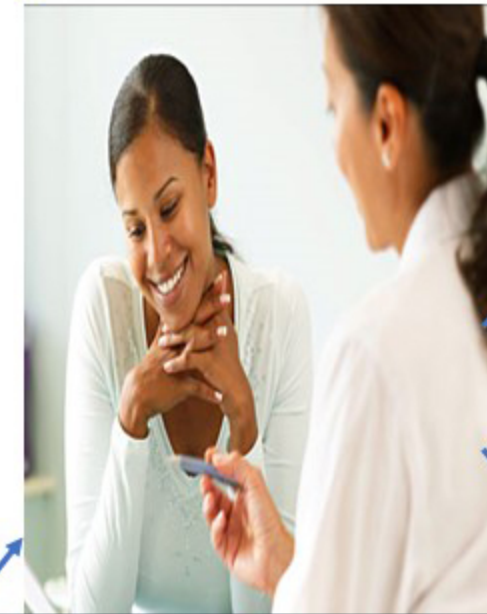
Case Manager II at a family self-sufficiency program